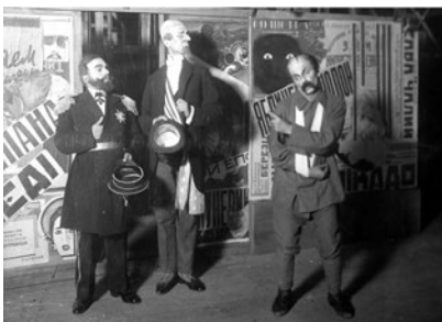
Рис. 4.1. A scene from the play «Jimmy Giggins». 1926.

The design of the posters was an integral part of the whole action, the significance of which is difficult to overestimate today, as most of the performances have not preserved audio or video, so the posters and photos remain almost the only visual markers of events. Compounds on the technology of letterpress, constructivist on the principles of organization of sheet space, posters of «Berezil» were never signed by their authors. But the already mentioned description from the article in the magazine «Theater Barricades» gives us reason to consider them the result of the collective work of «workshop members» ("Maketna maisternia", 1924, p. 19). It is a significant fact that the posters not only performed the functions of outdoor advertising on billboards, but were also used in the design of performances just on stage during the action (figs. 4.1–4.2). This is a rather responsible element of the artistic design of the play and we have every reason to consider the authors of the posters of the participants of the workshop, as they are unlikely to resort to