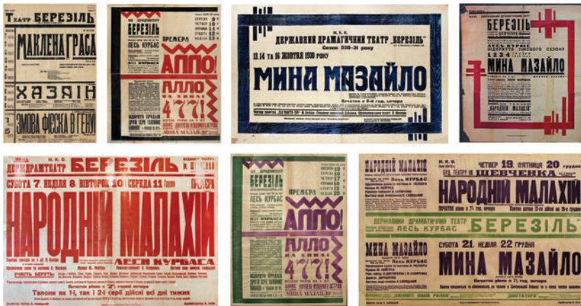
Fig. 6. Posters of the Kharkiv period. After May 1926.