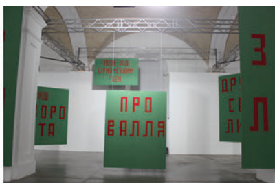
Fig. 8.1. A scene from «Macbeth» with the use of font decorations. 1924. Collection of MTMKU.