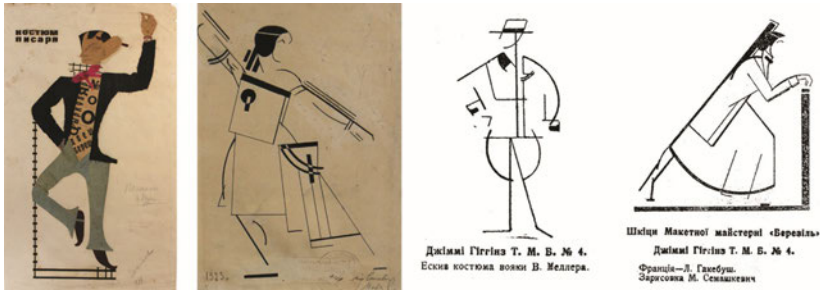
Fig. 9.1. V. Shklyajev, M. Simashkevych. Sketch of a scribe's suit. «Made a Fool» by M. Kropyvnytsky. AA «Berezil». 1924. Paper, application. 58x35 cm. Collection of MTMKU.