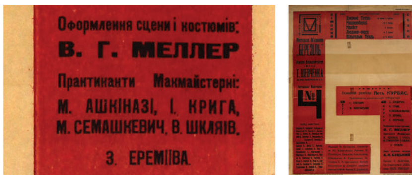
Fig. 10.1. Poster of the 4th workshop (fragment). 1923. Collection of MTMKU.

Рис. 10.1. Афіша 4-ї майстерні (фрагмент). 1923 р. Збірка МТМКУ.