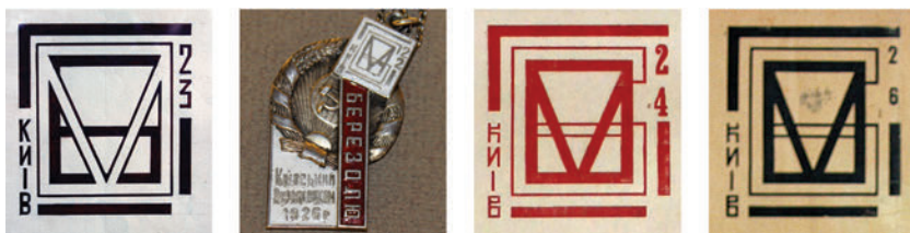
Fig. 1.1. Vadym Meller. Sketch of the logo of AA «Berezil». 1923. Paper, gouache. Collection of the Museum of Theater, Music and Cinematography of Ukraine.

Рис. 1.1. Вадим Меллер. Ескіз логотипу МО «Березиль». 1923 р. Папір, гуаш. Збірка Музею театрального, музичного та кіномистецтва України.