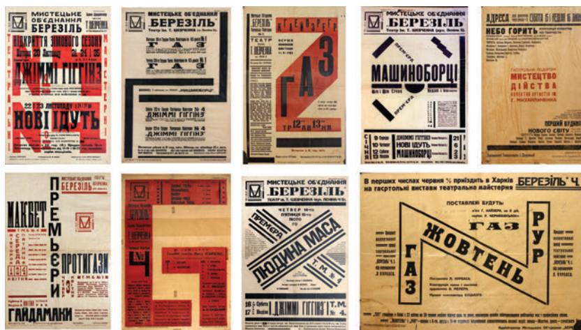
Fig. 5. Posters of the Berezil Artistic Association of the Kyiv period. Until May 1926. Collection of MTMKU.

Conditionally, the posters can be divided into two large groups – the chronology of the «Kyiv» and «Kharkiv» period (before and after May 1926). There is no striking difference between them, however, the first (Kyiv) period demonstrates a tendency to diagonal dynamic solutions, no fear of free space, inconsistency with the basic color scheme «black and red» (fig. 5). Instead, it is possible to state a larger number of horizontal formats in the Kharkiv period, noticeable compositional tightness, the appearance of two additional colors – green and purple (fig. 6). As for the authorship of the posters, it is known that at the time of moving to Kharkiv with V. Meller there were only M. Simashkevych and V. Shklyajev, and E. Tovbin and D. Vlasjuk joined later.