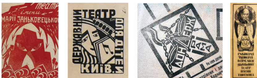
Fig. 2.1. Mykhailo Zhuk. The sign of the Maria Zankovetska Theater. Paper, woodcut. 1923. Collection of the Museum of Theater, Music and Cinematography of Ukraine. Photo by the author.

Рис. 1.3, 1.4. Типографічне відтворення логотипу. 1924, 1926 р. Фото автора з афіш відповідних років (збірка МТМКУ).