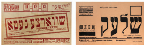
Fig. 12.3. Poster for the play «Schleck». Design V. Shklyajev. End of 1920s. Collection of MTMKU.