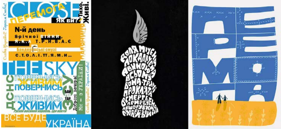
Fig. 4.1. Natalia Udris-Borodavko. Poster "Wartime Typography". 2022.