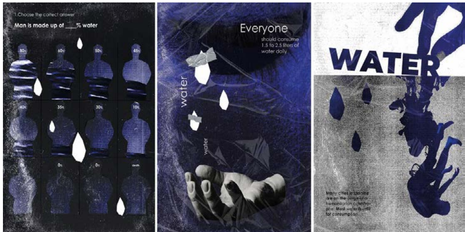
Fig. 5. Valery Rybchenko. Poster series "Water = Life". 2022.