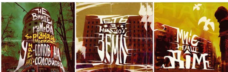
Fig. 3. Maria Soliar. A series of posters "Get out of our land!". 2022. 3rd place in the "Pangram" International student competition of fonts and calligraphy.