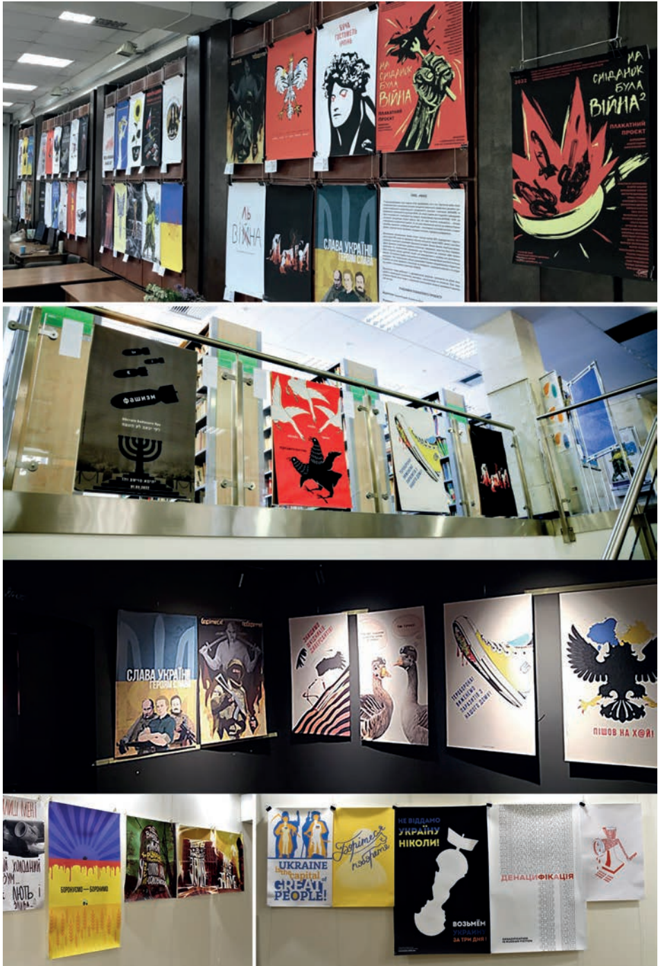
Fig. 9. Fragments of exhibitions in different locations. 2022.