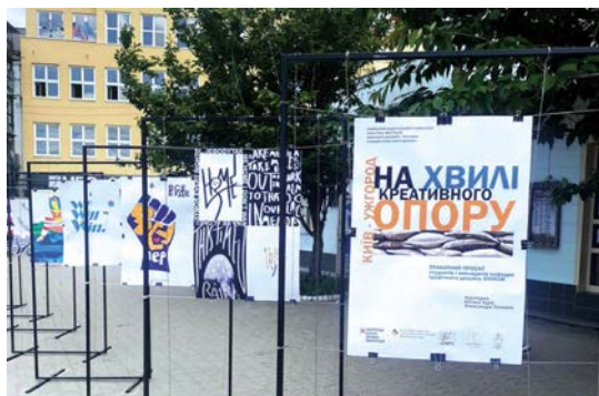
Fig. 7. May 23 – May 30, 2022. Poster exhibition "On the wave of creative resistance". 26 posters. The central square of the city. Ukraine, Uzhgorod.