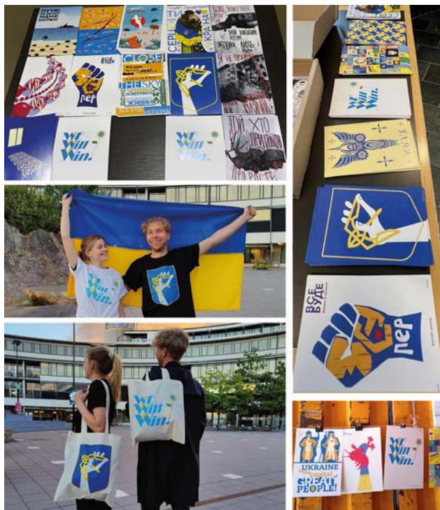
Fig. 10. Souvenir products (postcards, shopping bags, T-shirts) for donations to the Armed Forces of Ukraine.