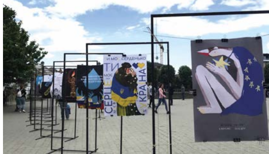
Рис. 7. 23 травня – 30 травня 2022. Виставка плакатів «На хвилі креативного спротиву». 26 плакатів. Центральна площа міста. Україна, Ужгород.