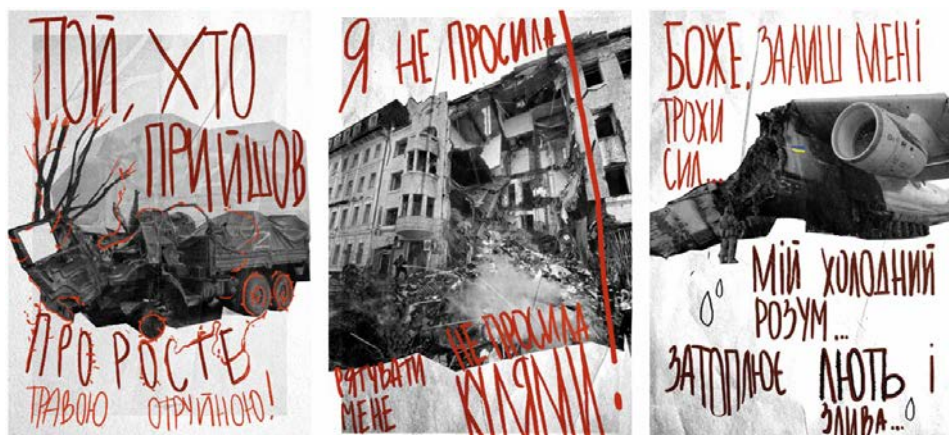
Fig. 2. Yulia Bublienko. A series of lettering collages "Hot Sayings of War". 2022.